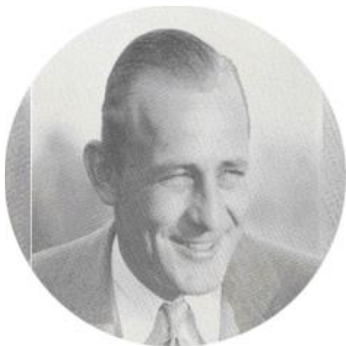
George Von Elm

In his day, George Von Elm joined the legendary Bobby Jones among the elite players in golf. The Salt Lake City native's crowning achievement came in 1926, when he defeated Jones 2 and 1 in the finals of the U.S. Amateur Championship at Baltusrol in New Jersey. At the time the U.S. Amateur was considered at least as prestigious as the U.S. Open.