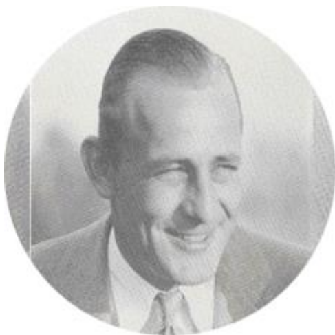
George Von Elm

In his day, George Von Elm joined the legendary Bobby Jones among the elite players in golf. The Salt Lake City native's crowning achievement came in 1926, when he defeated Jones 2 and 1 in the finals of the U.S. Amateur Championship at Baltusrol in New Jersey. At the time the U.S. Amateur was considered at least as prestigious as the U.S. Open.